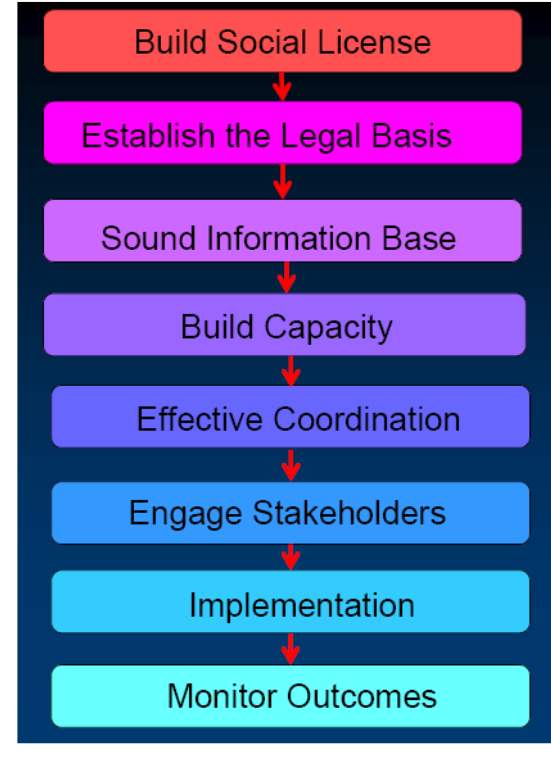
Figure 2. Sequential framework for implementing the goals and objectives of the National WATSAN Policy.

It is almost impossible to manage what you do not know. The basic information to effectively manage water and sanitation in SI is incomplete and largely inaccessible. Even the knowledge of the distribution and variability of rainfall across the country is patchy. The availability and sustainable yield of surface and groundwater sources is poorly known as is its quality. Regional demand for water, particularly by institutions, industries, commerce and irrigated agriculture is largely undocumented and information on the types of water supply and sanitation systems in use is incomplete. As well, the statistics on water and hygiene related illnesses are sparse. The information that is available is not easily accessible. Establishing a sound information base is an essential step for better WATSAN management.