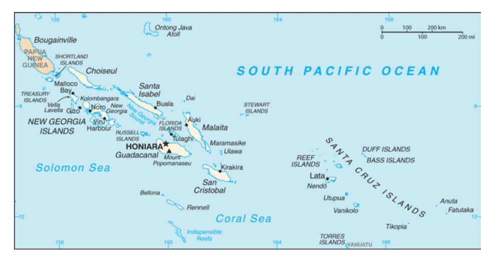
Figure 1 The provinces and islands of Solomon Islands (http://www.lib.utexas.edu/maps/cia12/solomon_islands_sm_2012.gif)

This integrated National Water and Sanitation (WATSAN) Sector Plan was developed by the Cabinet-appointed National Intersectoral Water Coordination Committee (NIWCC) which reports through Minister of Mines, Energy and Rural Electrification to Cabinet of the Solomon Islands Government (SIG). Its development was supported by the Secretarial of Pacific Countries (SPC) Applied Geoscience Division (SOPAC) under the Pacific IWRM National Planning Programme in a process facilitated by Professor Ian White of the Australian National University. Development of the plan was based on the principles of integrated water resource management in island counties, water use efficiency and adaptation to climate change.